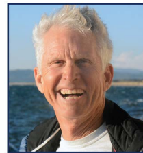
RANDY SMYTH Olympic Medalist in Multi-Hulls