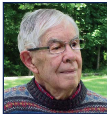
BILL BENTSEN Olympic Medalist; Rules Guru