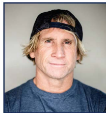
ROBBY NAISH Windsurfing & Kiteboarding Pioneer; 24 World Titles